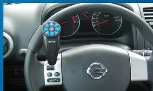
StickSteer Secondary Controller Steering knob that controls eleven secondary functions with thumb