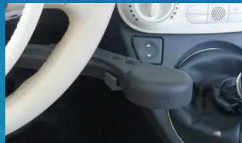
907 Brake Lever series Mount right or left on the column or floor mount