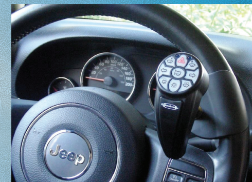
1096E STICK STEER Secondary Controller