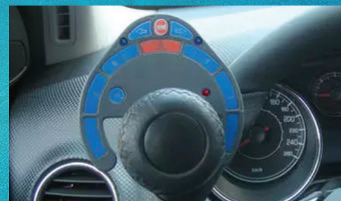
1094FV Secondary Controller Steering knob that controls eleven secondary functions with fingertips