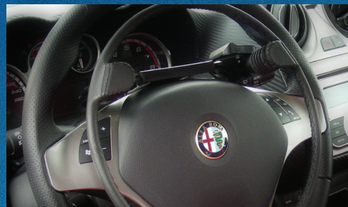
Over-Ring Accelerator Pairs with a 907 series brake lever