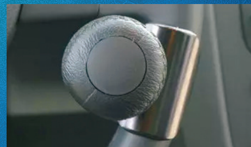
Steering Knob High quality steering knob with quick disconnect at a great price