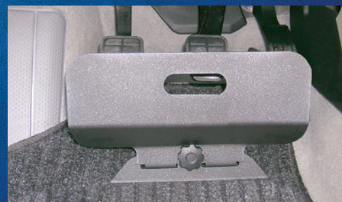
Pedal Guard Removable 3 pedal guard with large mounting plate for easy installation