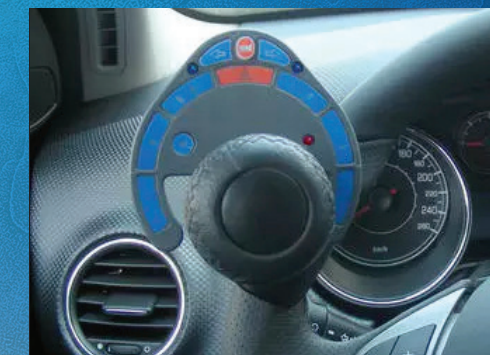
1094 SECONDARY Controller