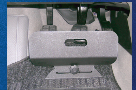
3 PEDAL GUARD