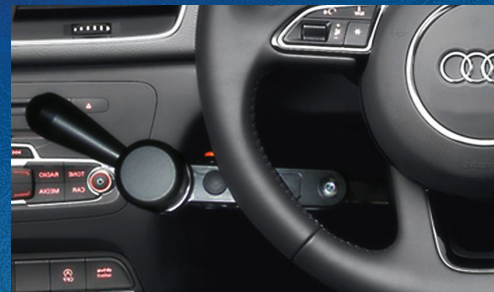
Modena Push Right Angle Accelerator/Brake Column mount left or special order right