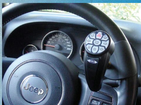
1096E STICK STEER Secondary Controller