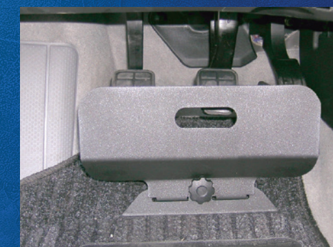
3 PEDAL GUARD