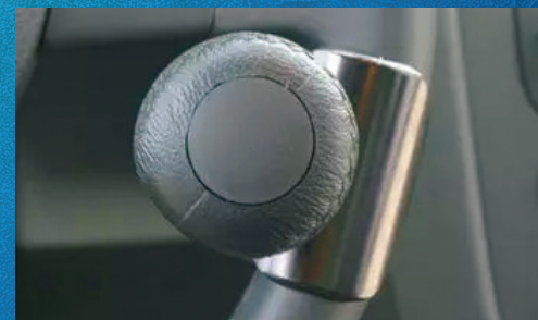
Steering Knob High quality steering knob with quick disconnect at a great price