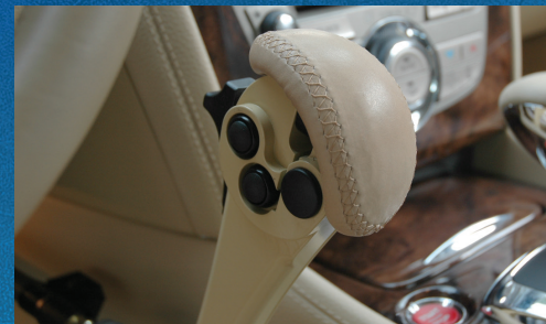
GT2 Accelerator/Brake Floor Mount Trigger or Rock Accelerator and push for brake