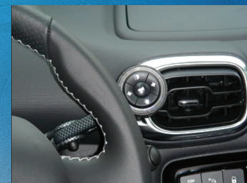
898 FIVE FUNCTION CONTROLLER