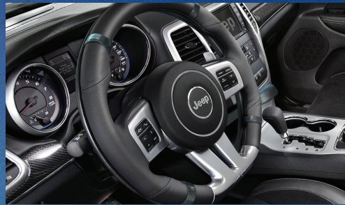
Ghost Under Ring Accelerator Pairs with a 907 series brake lever