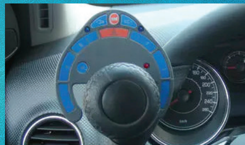
1094FV Secondary Controller Steering knob that controls eleven secondary functions with fingertips