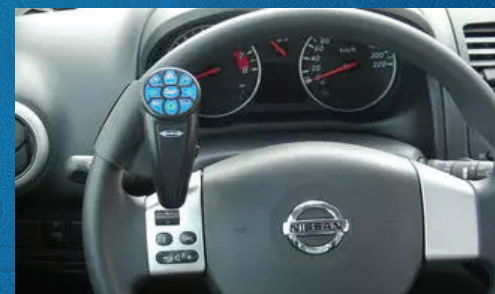
StickSteer Secondary Controller Steering knob that controls eleven secondary functions with thumb